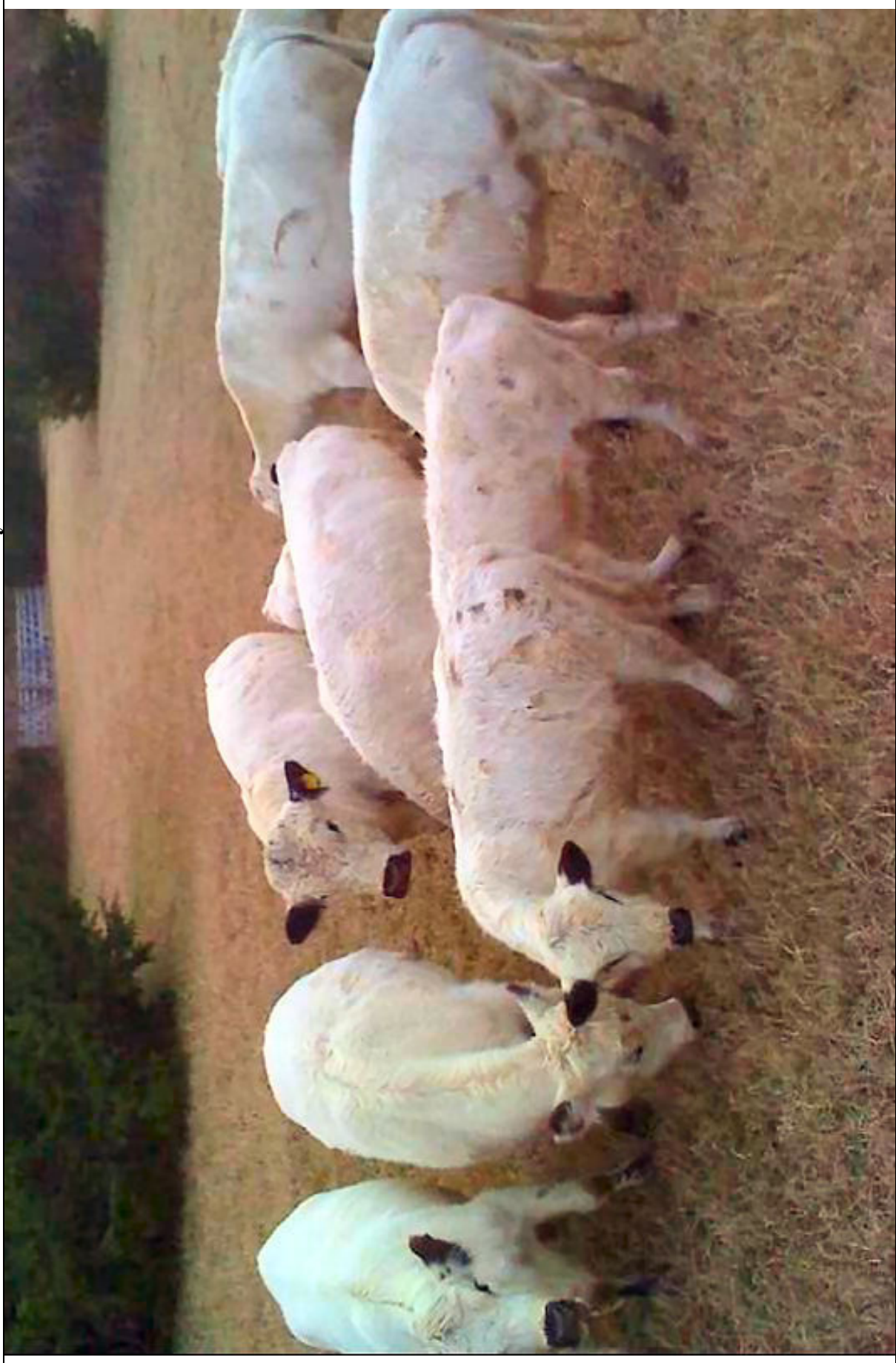
Picture of the LaFollett herd taken early March 2010.